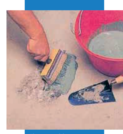
Floor patching: application of slurry