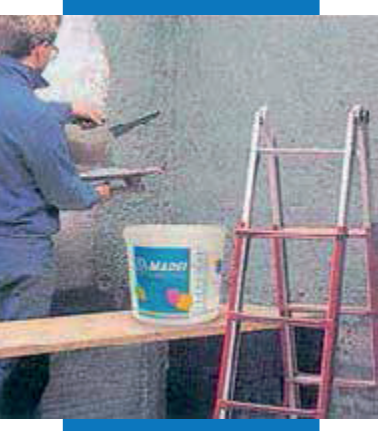
Wall render admixed with Planicrete SP