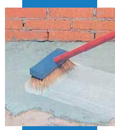
Applying cement slurry modified with Planicrete SP