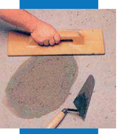
Floor patching: final smoothing