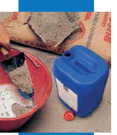
Mixing cement mortar with Planicrete SP for tile fixing