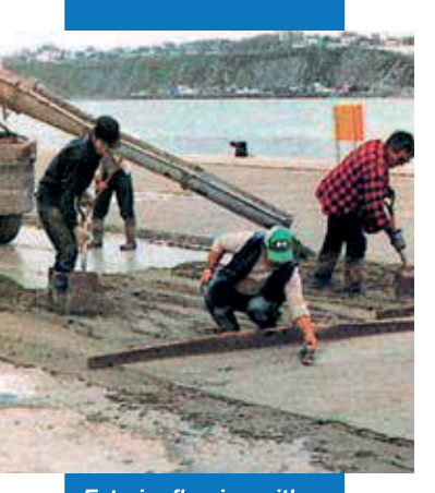
Exterior flooring with concrete admixed with Planicrete SP.