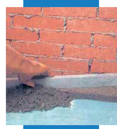
Applying cement screed modified with Planicrete SP