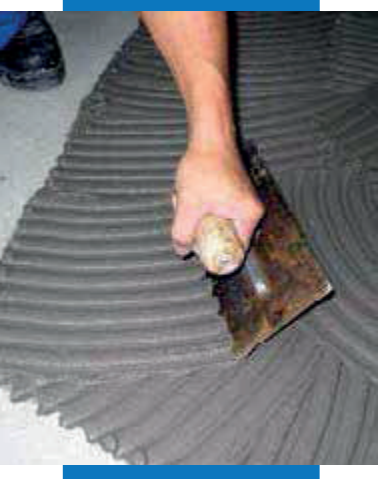
FIXING OF TILES Apply the adhesive onto the prepared substrate using a notched trowel. Do not spread more than 1m<sup>2</sup> at a time.