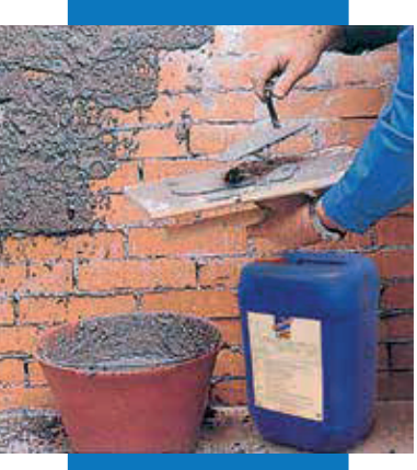
Spatter - dash coat modified with Planicrete